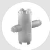
1 Universal Key