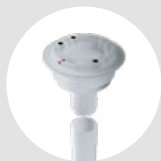
2 Dip tube S62x5