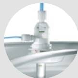
3 Dispensing head