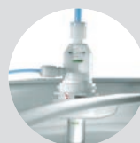
3 Dispensing head