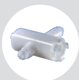
1 Universal Key