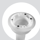
2 Dip tube S62x5